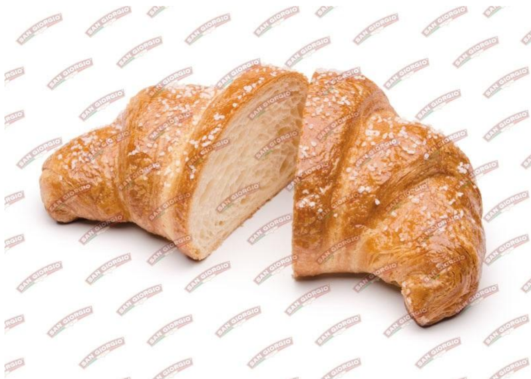
The photo is for illustration only

Edition: 03 Review: 00 Date: 19/02/2018 Page 4/4